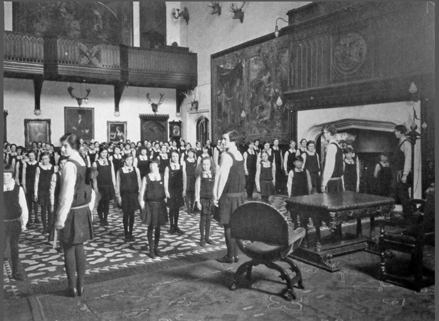
The Abbot's Hall in 1925 in the days when Battle Abbey was an all girls school. We believe this is a department class but can't be 100% sure. The hall is in its pre-fire days with a grand wooden fireplace surround and tapestries, antlers and paintings all lost in the fire of 1933.