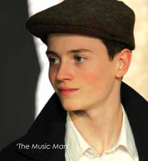
'The Music Man'