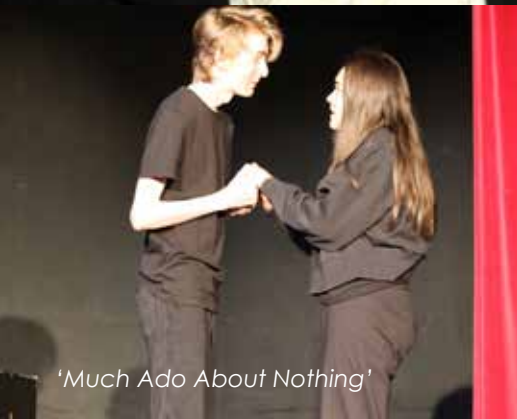
'Much Ado About Nothing'